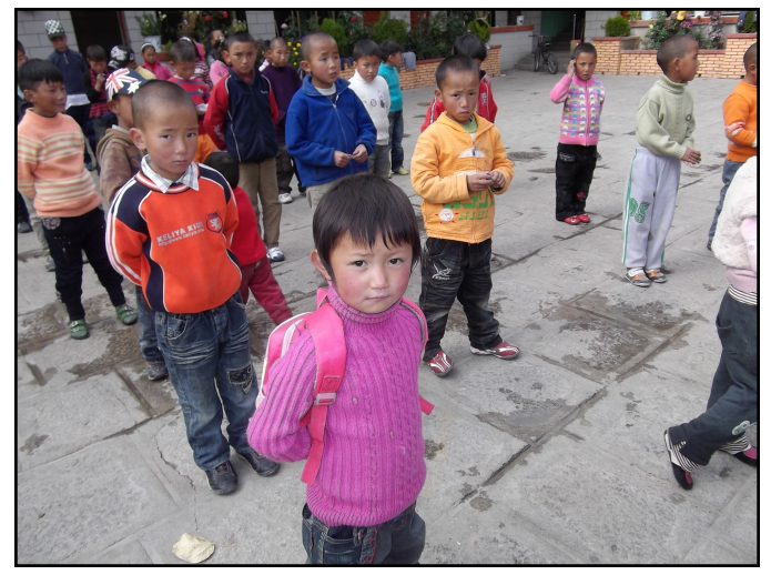
Children at the Dickey Orphanage.

made by the children. That Saturday morning, the